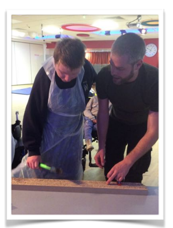
As part of our student takeover event pre-formal students in school were invited to take part in a life skills event exploring cookery, <u>nursing</u>, first aid, home maintenance woodworking, exploring tools and safety. They had a lot of fun hammering!

In November we once again took part in <u>Takeover Week</u>, where our young people were in charge and doing all of our jobs! They all had a fantastic time, learnt lots and enjoyed the experience of taking on adult responsibilities.